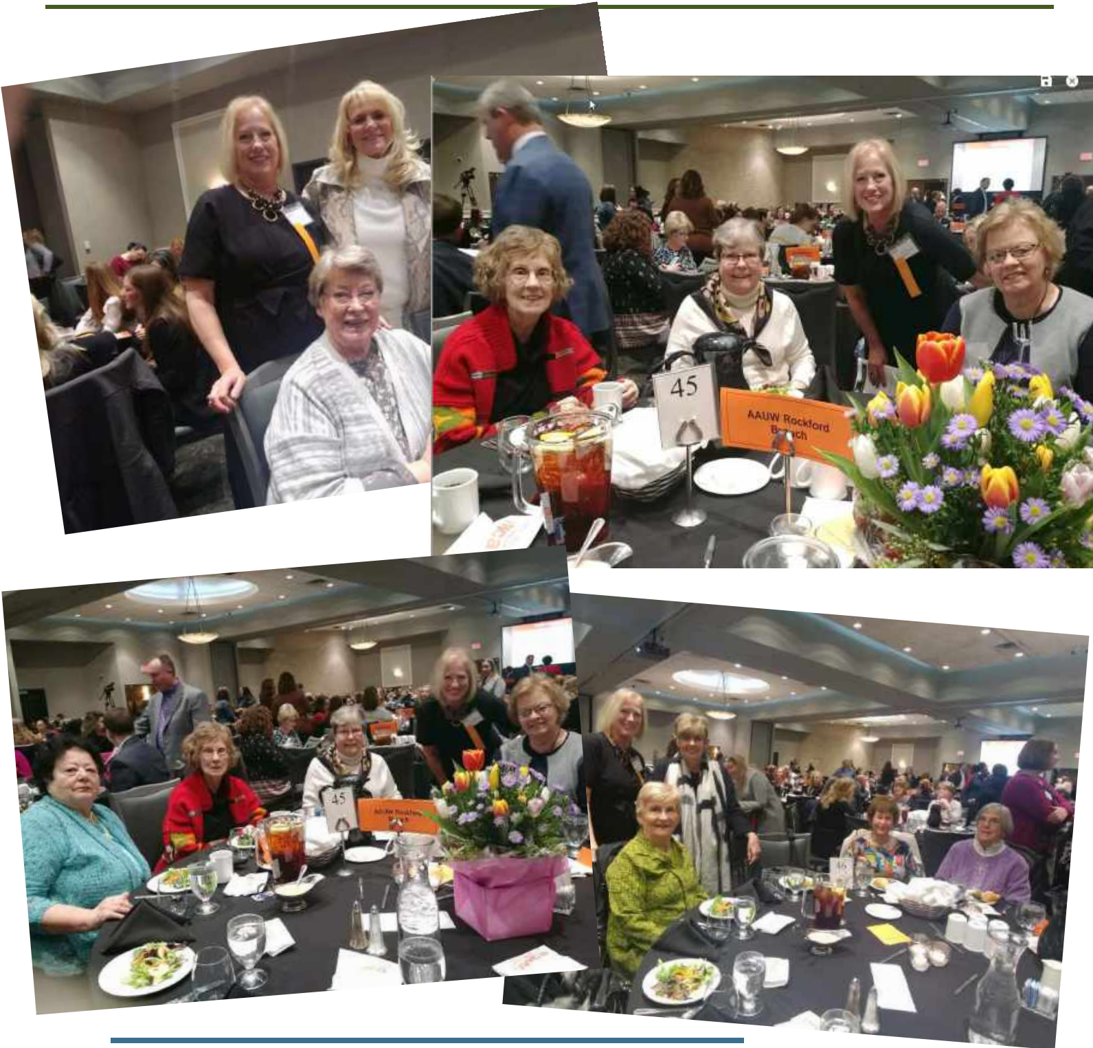
Branch members attended the YWCA Leader Luncheon on March 3.